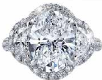
5 CT OVAL