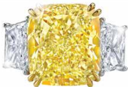
12 1/2 CT NATURAL FANCY LIGHT YELLOW CUSHION SHAPE